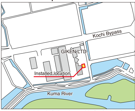
mage created by GIKEN based on fundamental geospatial data from Geospatial Informatic Authority of Japan (https://fgd.gsi.go.jp/download/menu.ph