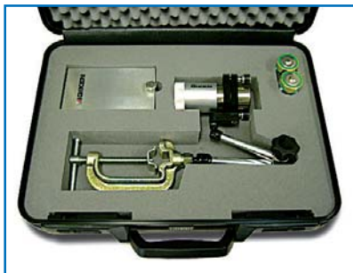
The Store Case