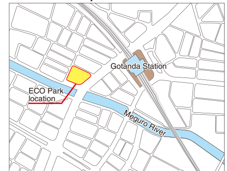
Image created by GIKEN based on fundamental geospatial data from Geospatial Information Authority of Japan ( https://lgd.gsi.go.jp/download/menu.php )