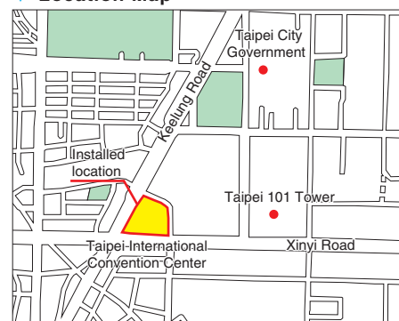
Image created by GIKEN based on fundamental geospatial data from Geospatial Information Authority of Japan ( https://gdg.sgi.go.jp/download/menu.php )