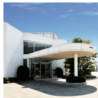
Kochi Head Office