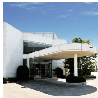
Kochi Head Office