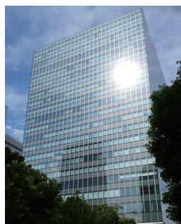
Tokyo Head Office