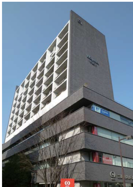
Complete view of building