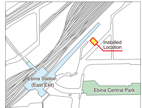
Image created by GIKEN based on fundamental geospatial data from Geospatial Information Authority of Japan ( https://ltd.gsi.go.jp/download/menu.php )