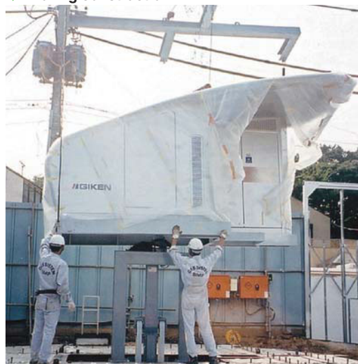
Installation of the entrance booth