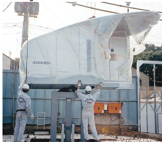
Installation of the entrance booth